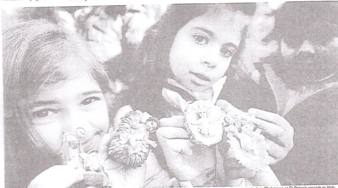
Children show their figurines of Baby Jesus during the traditional benediction of the figurines as part of the Sunday Angelus prayer before Christmas at St Peter's square in Vatican... yesterday.

NEWS 50 feared killed as rival cult groups fight in Rivers